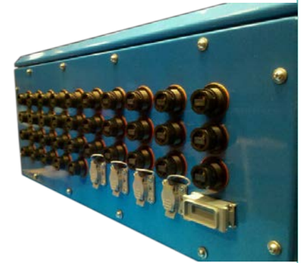
FULLY CUSTOMIZED PATCH PANELS

Instant Data Centers, LLC Micro Data Center Solutions www.InstantDataCenters.com Info@InstantDataCenters.com (480) 462-0599 510 S. 52nd Street STE 103 Tempe, AZ 85281